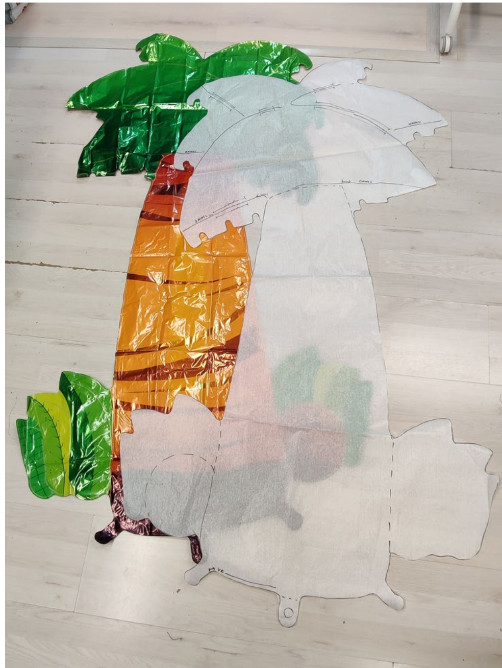
Artworks in process, 2023, Inflatable, textile, sewing, photographs, disguise object