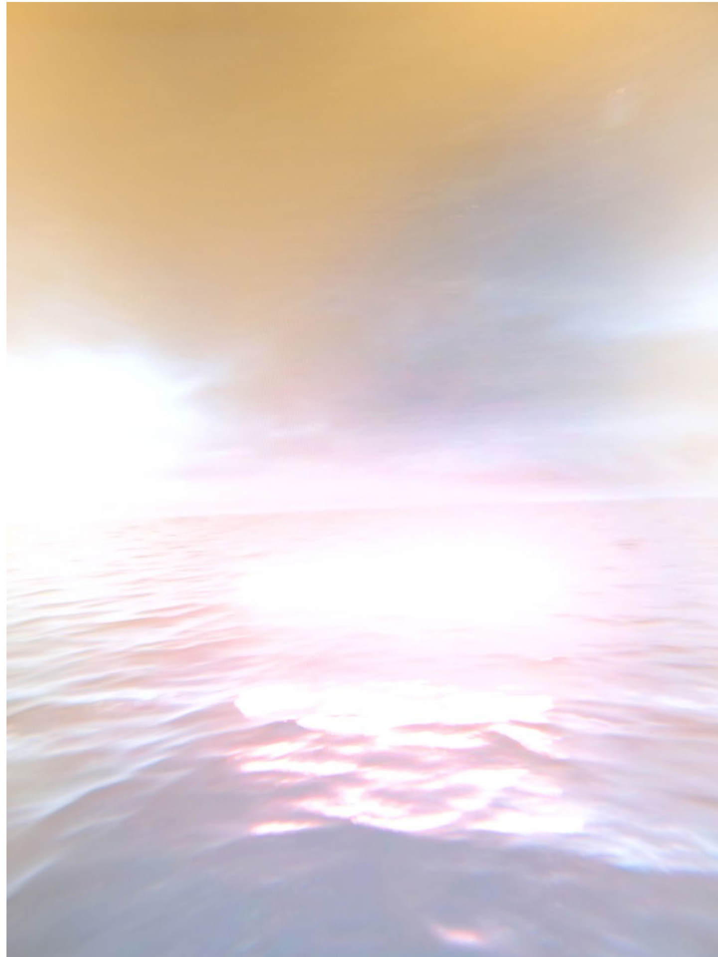
«Territories», photograph on aluminium, 100x80 cm, 2022