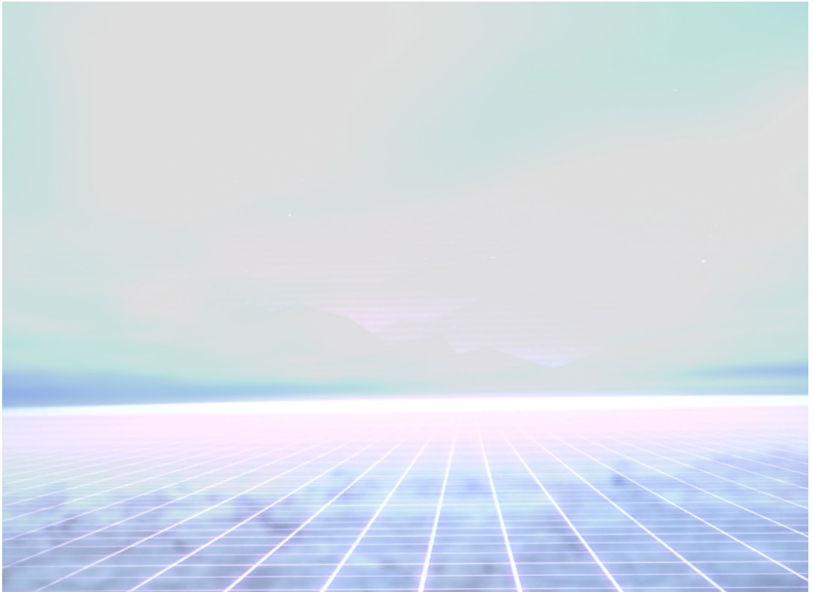
«Territories», photograph on aluminium, 100x80 cm, 2022