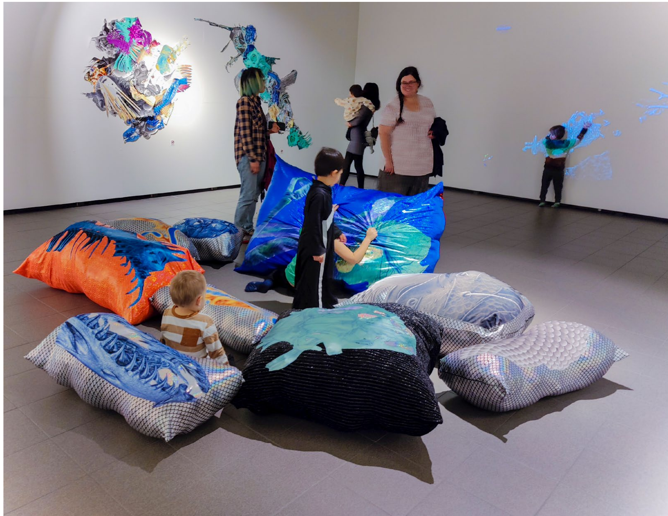
«Alternative living codes», microscopic insect photos printed on textile, installation , 2022