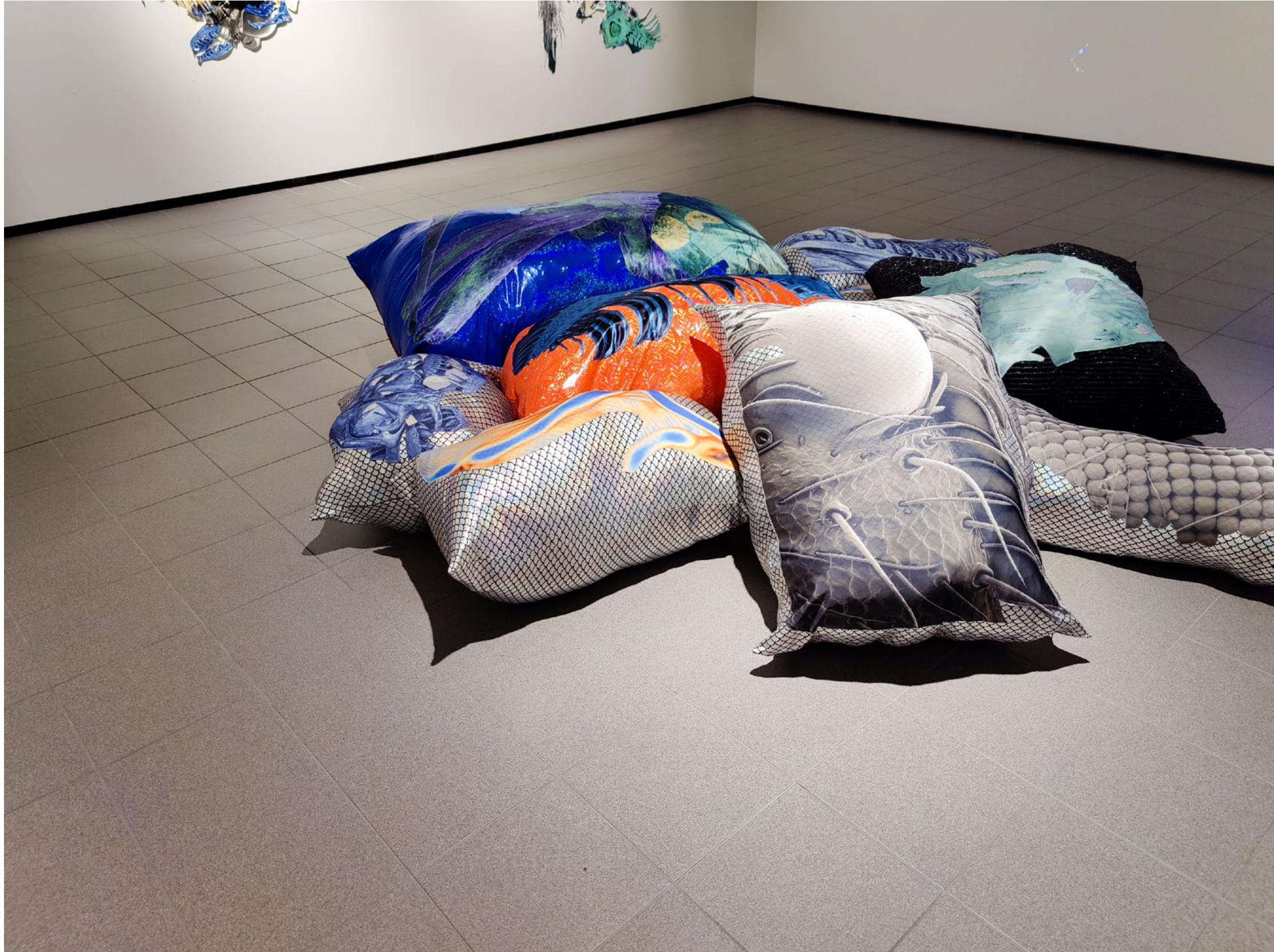
«Alternative living codes», microscopic insect photos printed on textile, installation , 2022