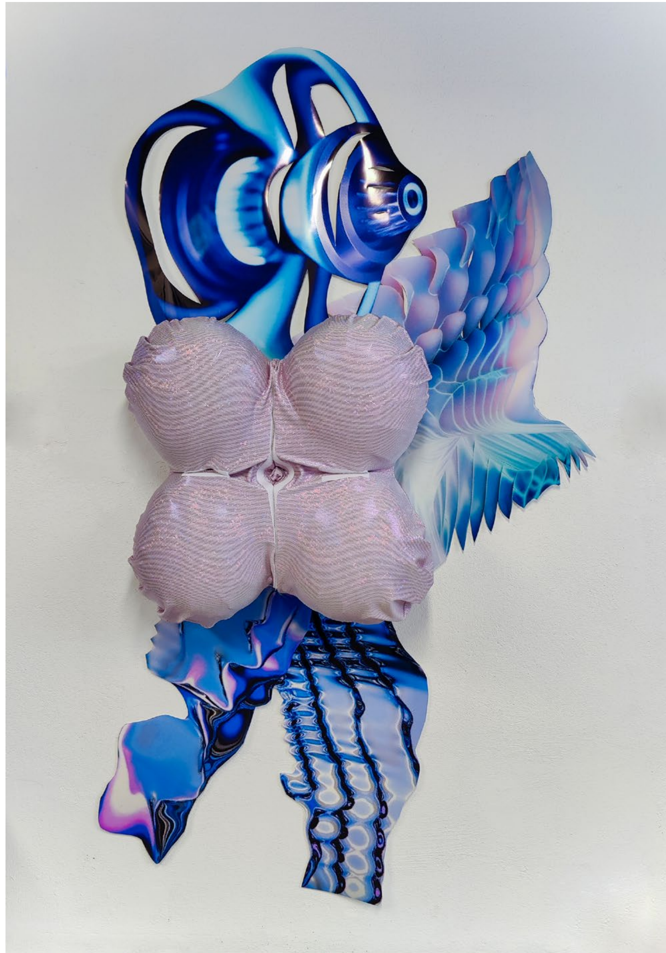
«Alternative living codes», microscopic insect photos printed on textile, inflatables , 250cmx60cm, 2023