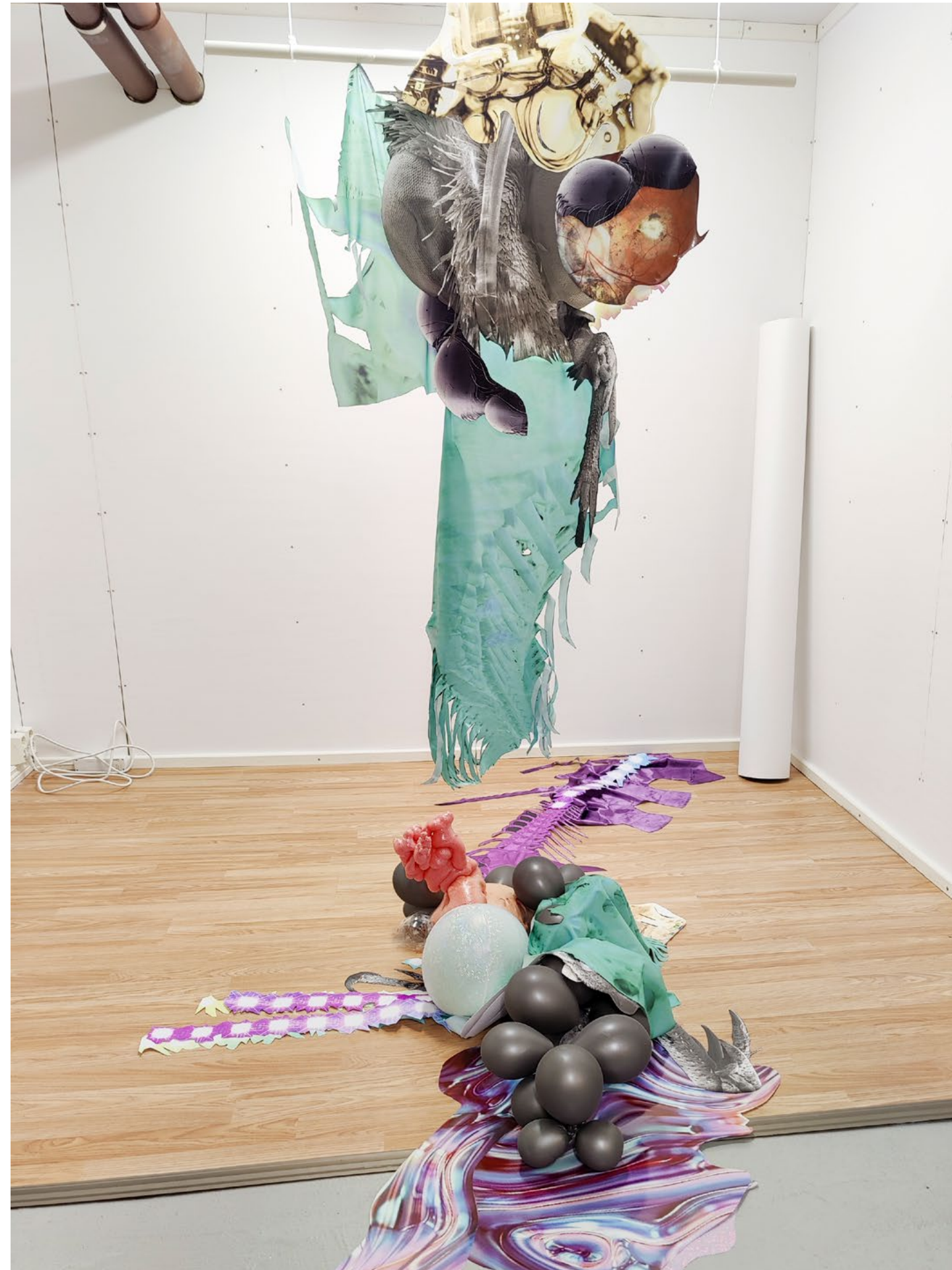
«Alternative living codes», microscopic insect photos printed on textile, inflatables, installation , 2023