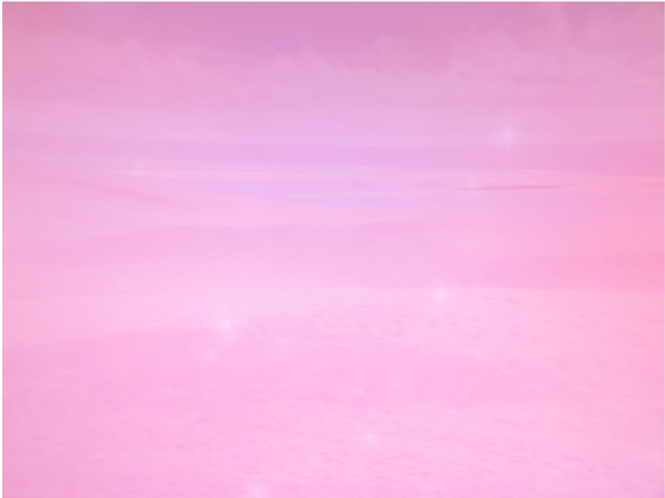
«Territories», photograph on aluminium, 100x80 cm, 2022