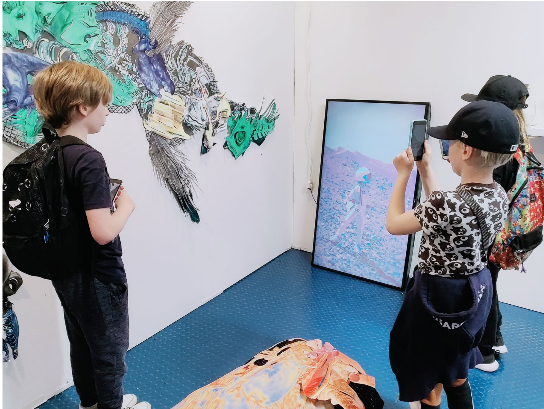
Installation with videos and photocollages, 2023